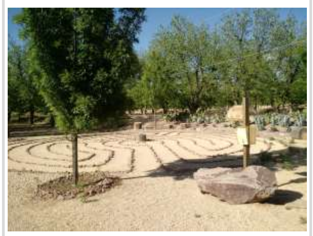
Labyrinth and a rosary walk are also on our grounds.

Consider trying a hermitage at Holy Cross Retreat Center., where you can have quiet time for prayer and rest and creativity for a few days or up to a month!