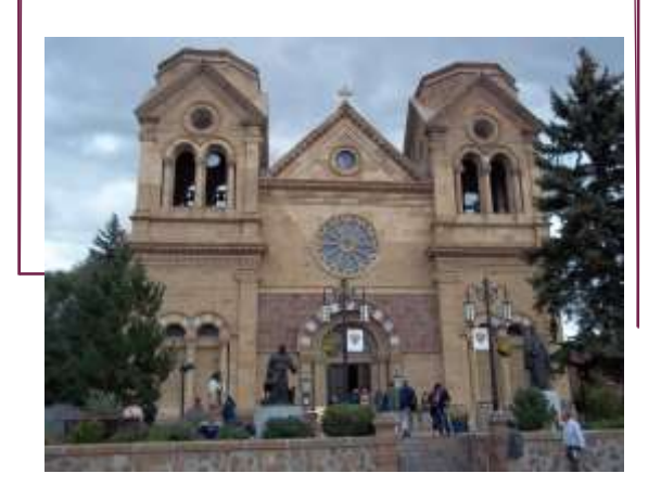
Visit the Cathedral in Santa Fe and learn of its history.