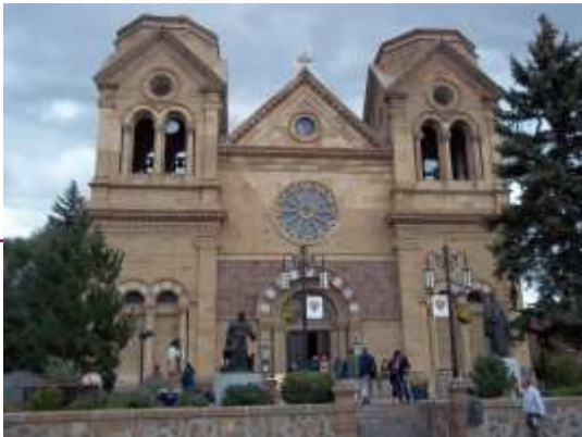
Visit the Cathedral in Santa Fe and learn of its history.