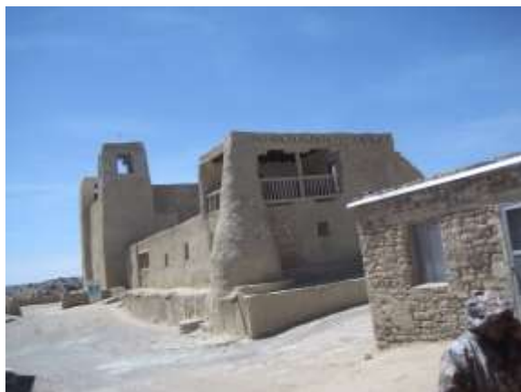
San Esteban Mission at Acoma

This pilgrimage will provide time to visit and experience the missions mainly along the Camino Real, the road which followed the Rio Grande. There will be time for background, input by local people, mass and prayer each day, and for quiet as well as exploring local culture. We expect to visit several missions, such as Española, Taos, Acoma, Ysleta, San Felipe in Albuquerque, and Socorro,