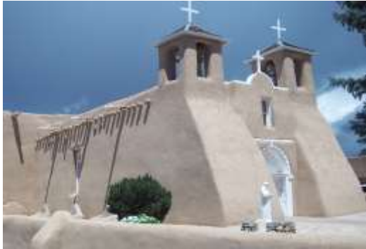
San Francisco Mission at Rancho de Taos